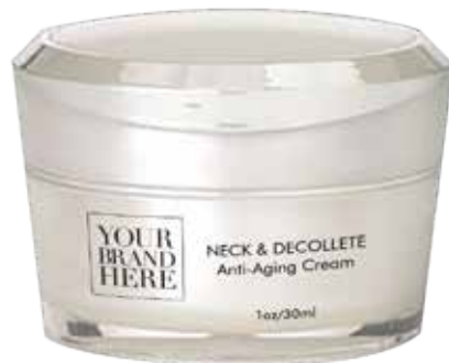
30ml XLA Jar