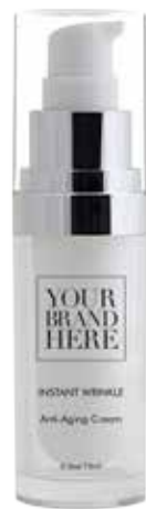
15ml Diptube Bottle