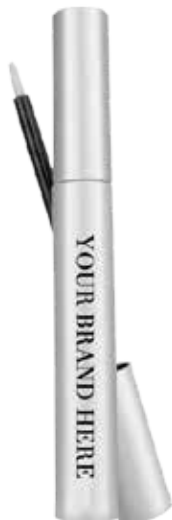
3ml Chrome Bottle

Ingredients: Purified water, sodium chloride, Benzalkonium chloride, Citric Acid, Disodium phosphate, Cellulose gum, Panax Ginseng Extract, Swertia Japonica Extract, Biotin.