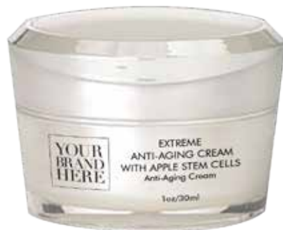
30ml XLA Jar