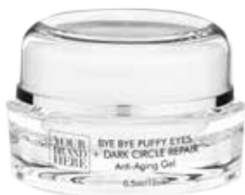
15ml Acrylic Jar