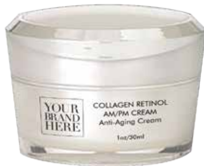
30ml XLA Jar